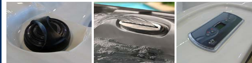
Adjustable Water Diverters