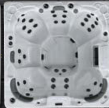
OCEAN BREEZE 7 Size: 92" x 92" x 39" Jets: 42 Orion SS Jets Gallons: 425