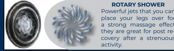
ROTARY SHOWER Powerful jets that you can place your legs over for a strong massage effect they are great for post recovery after a strenuous activity.