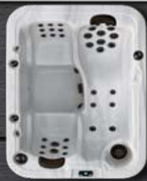
SUNSET COVE 3 Size: 60" x 82.5 x 33.5" Jets: 36 Orion SS Jets Gallons: 160