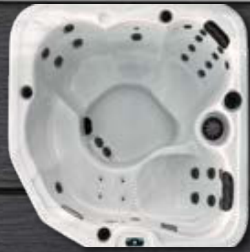
TREASURE CAY 5 Size: 78" x 78" x 36" Jets: 30 Orion SS Jets Gallons: 280