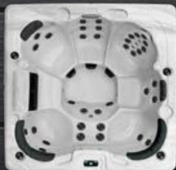
TRANQUILITY HARBOR 7 Size: 82" x 82" x 39" Jets: 42 Orion SS Jets Gallons: 295