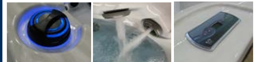
Adjustable Water Diverters