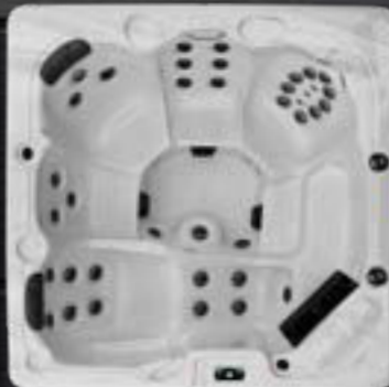
SERENITY COVE 5 Size: 82" x 82" x 39" Jets: 42 Orion SS Jets Gallons: 295