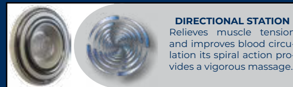
DIRECTIONAL STATION Relieves muscle tension and improves blood circulation its spiral action provides a vigorous massage.