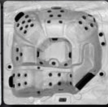
CABANA BAY 5 Size: 92" x 92 x 39" Jets: 42 Orion SS Jets Gallons: 425

THE MOST COMFORTABLE SPA. MADE IN THE USA.