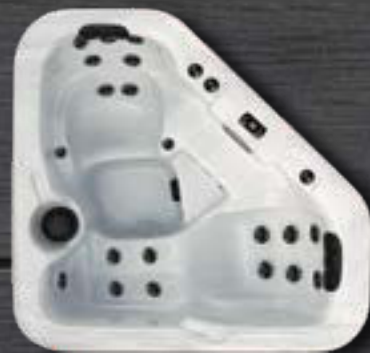
BIMINI 2 Size: 72" x 72" x 33.5" Jets: 21 Orion SS Jets Gallons: 160