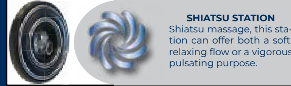
SHIATSU STATION Shiatsu massage, this station can offer both a soft, relaxing flow or a vigorous pulsating purpose.