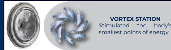
VORTEX STATION Stimulated the body's smallest points of energy.