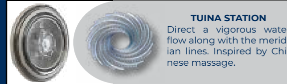
TUINA STATION Direct a vigorous water flow along with the meridian lines. Inspired by Chinese massage.