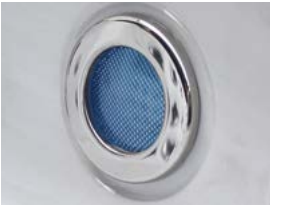
Underwater LED Lighting