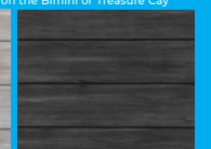
Elite Ash Upgrade