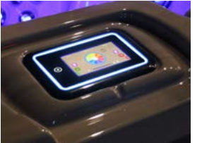
Illuminated Topside (K.1000 Standard)