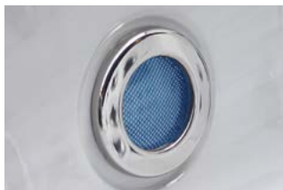
LED Underwater Lighting