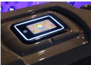
LED Topside K.1000