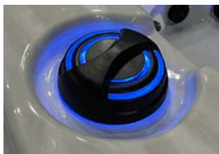
LED Air Diversers